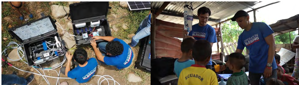
Aquifer system detail