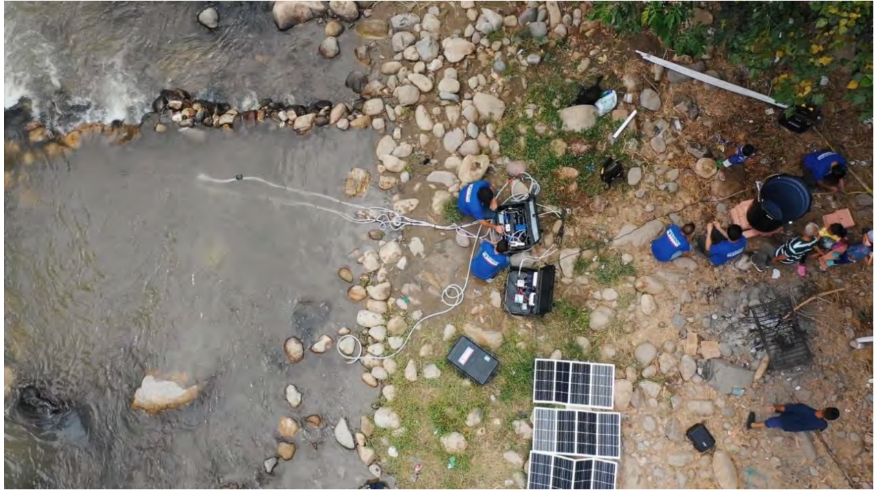
Universal Aquifer purifying water from a remote river, running on solar power